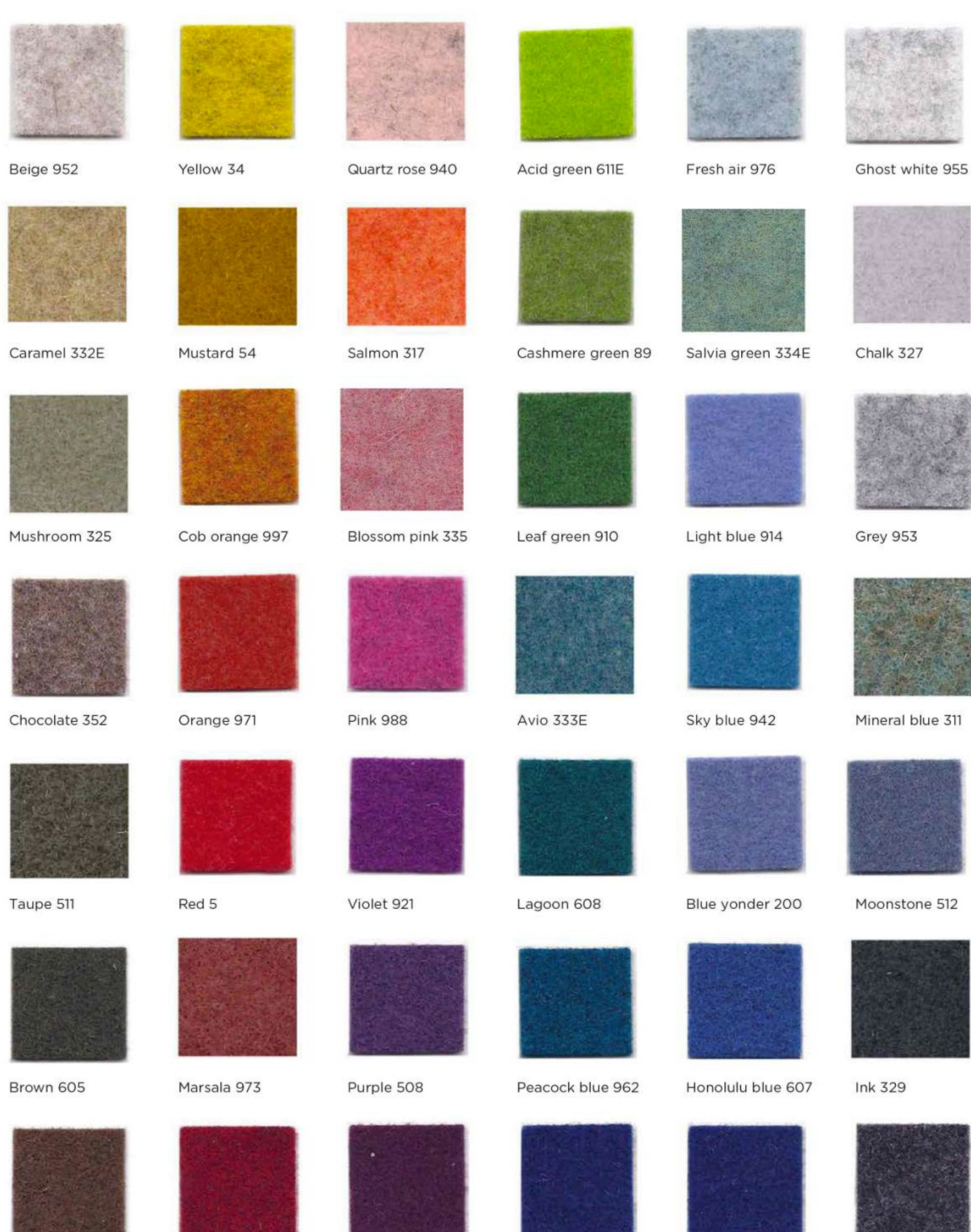
Dark musk 22