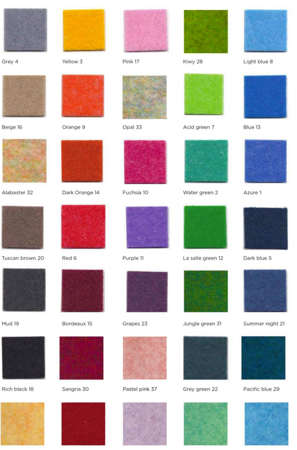
Pale yellow 41